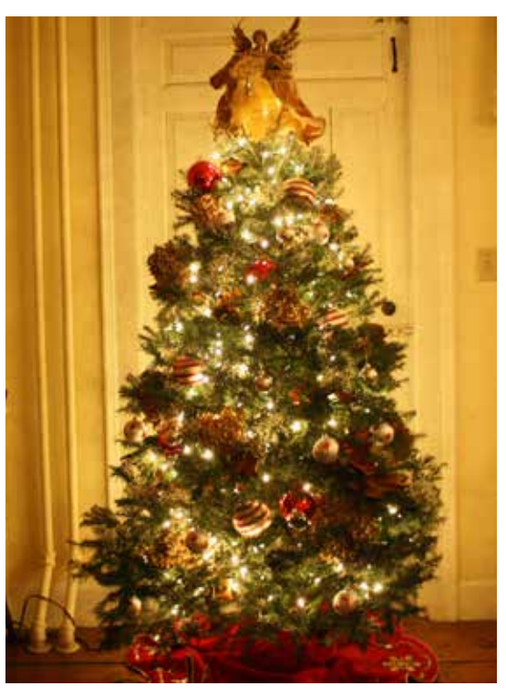
The Hart House tree, donated by Mar. Floral and Botanicals, glows.