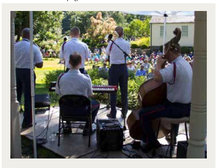
The US Coast Guard Dixieland Band will return to the OSHS campus Sunday, August 26, from 4 to 5:30 pm.