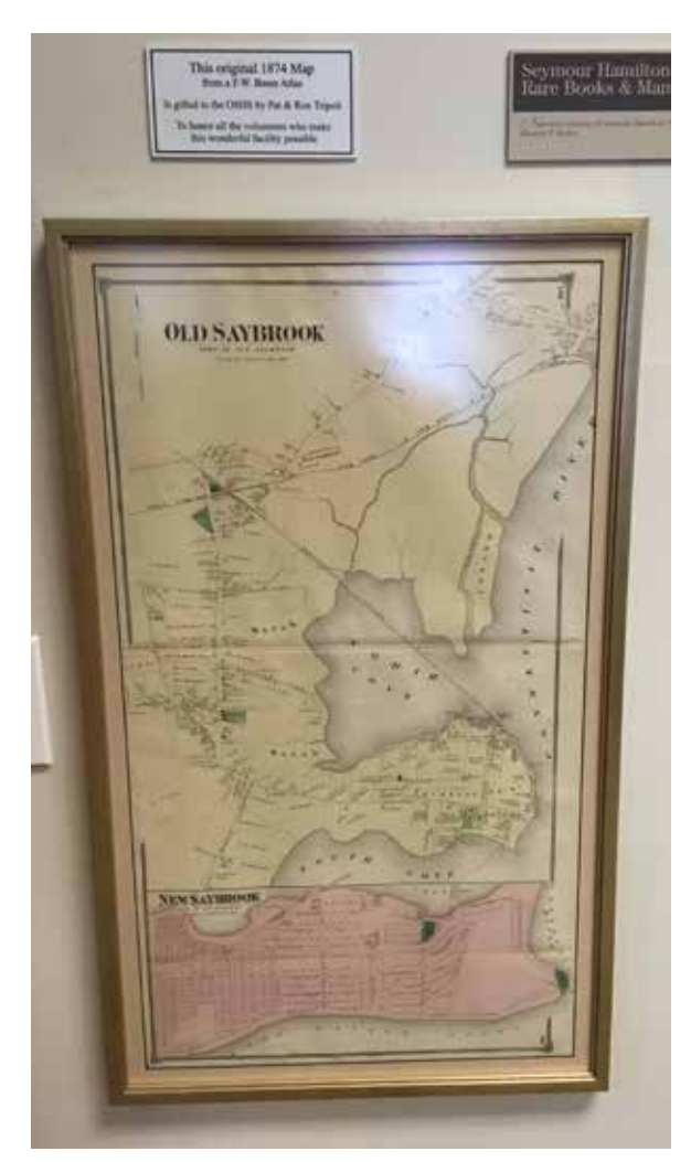
1874 Beers Atlas donated by Pat Tripoli. See article on page 5