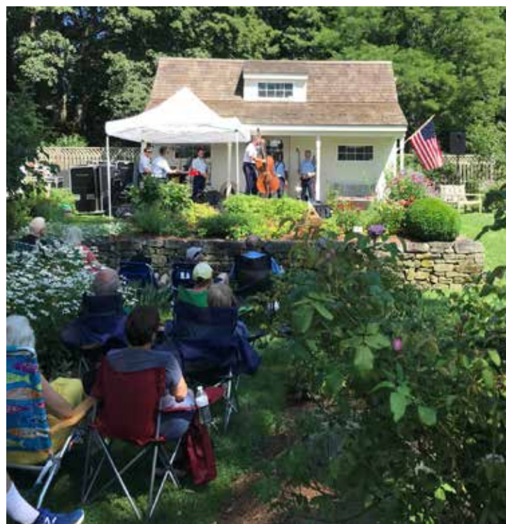
United States Coast Guard Preservation Jazz Band Concert in our Public Heritage Gardens on July 24.