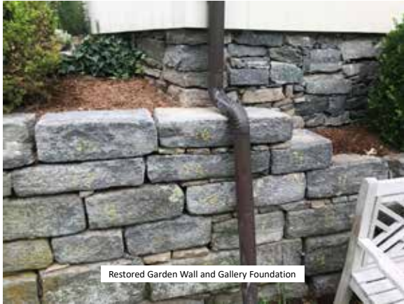
Restored Garden Wall and Gallery Foundation