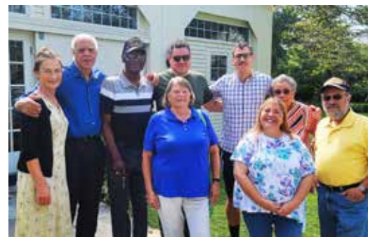
James/Petry family and friends visit the exhibit.