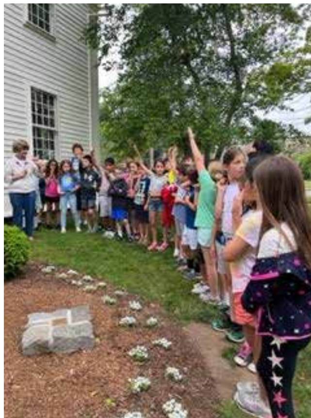
Third graders visit the memorial